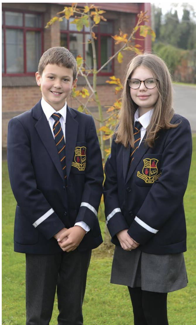
Castledearg High School Uniform